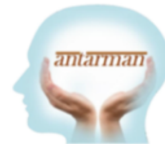
A N T A R M A N Centre for Psychosocial wellbeing